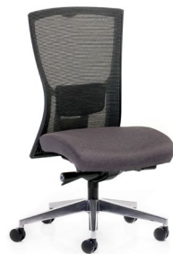
DOMINO 2 EXECUTIVE