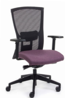
with optional 3D adjustable arms.