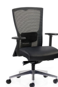
with black Italian leather.