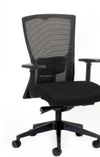
with black fabric.