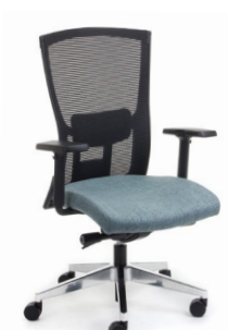
with optional 3D adjustable arms.